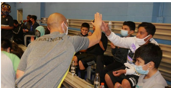
Planet Fitness Personal Trainer congratulating member on his dodgeball win