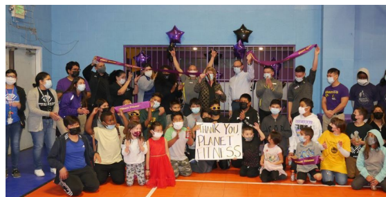
East Fresno Club & Planet Fitness representatives celebrate with a ribbon cutting ceremony